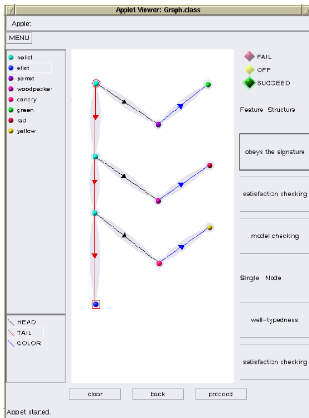
Figure 2: Graphically evaluating constraint satisfaction of feature structures.

from the elist node. The query, asked in a separate window, is whether the feature structure satisfies the constraint ( nelist , head:(parrot, color:green), tail:nelist). Since this is the case, the green light on the function console to the right is signaling succeed . If we were to perform model checking of the same feature structure against the same constraint, checking would fail, and MoMo would indicate the nodes of the feature structure that do not satisfy the given constraint.